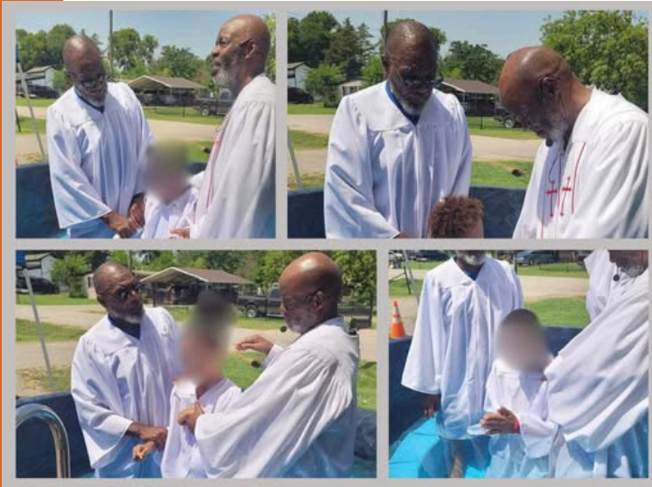
New Horizon Missionary Baptist Church SEVEN BAPTISMS

As the Gospel is shared through DBA churches, we know the next step of obedience is baptism. We also recognize that many churches may not have a place or way to baptize. For those times, DBA offers two portable baptism options—one large and one small. If your church would like to borrow one (free for DBA churches), simply scan the QR code to reserve either one.